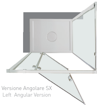
Versione Angolare SX Left Angular Version